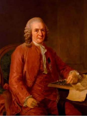
Copy by Laurent Pasch of Roslin's portrait of Linnaeus

Conservation of the letters at the Book & Paper Conservation Studio, University of Dundee