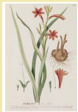
Lectotype of Watsonia meriana (L.) Mill., from Trew, Plantae Selectae

This major new work will be published in May 2007, coinciding with the tercentenary of the birth of Carl Linnaeus.