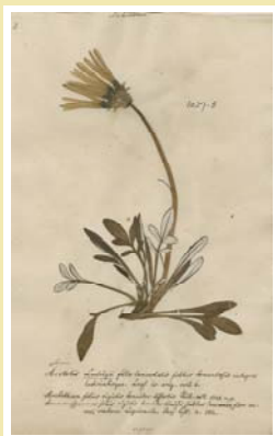
Lectotype of Othonna rigens L., collected by Schreber

The book contains accounts of Linnaeus' publications and those of the many other botanists that contributed to his knowledge of plants.